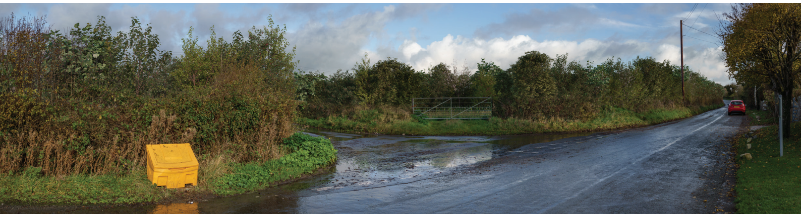
Indicative Viewpoint from junction of Port Road and Rockshead Lane, 15 years post construction