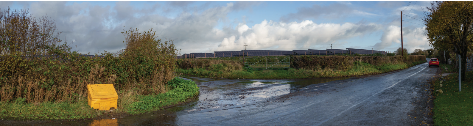
Indicative Viewpoint from junction of Port Road and Rockshead Lane, one year post construction